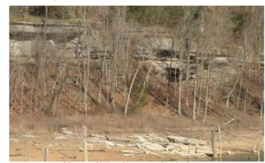
Stop 6. View of finger of lake when water level is low.

Stop 9. The base of Boone Formation is exposed along the trail here. This is a good time to compare the cherty limestone in the Boone to the fairly chert-free St. Joe Limestone. Look closely and you might find trace fossils.