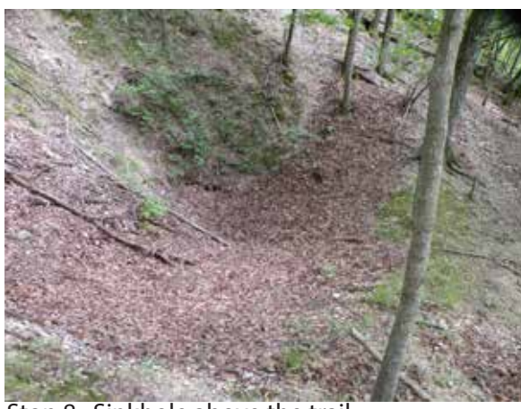
Stop 8. Sinkhole above the trail