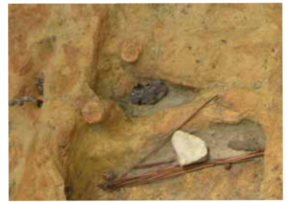
Stop 10. Trace fossils in the Boone Formation.

As you get closer to the trail head you will see many pieces of limestone containing crinoid fragments. You will also see chert fragments in the limestone. These fragments have weathered from the basal portion of the Boone Formation