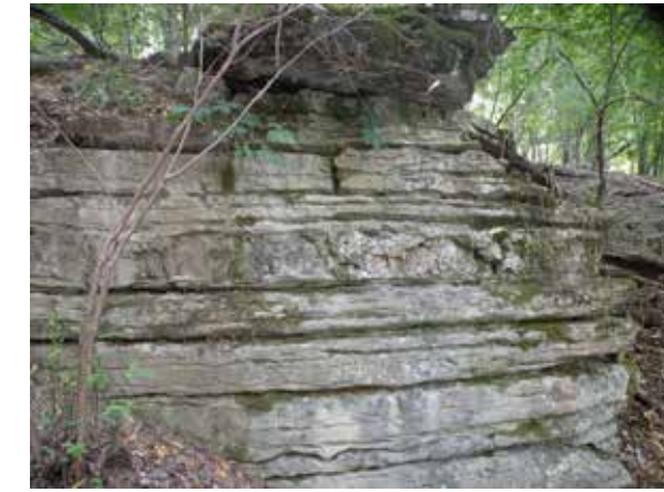
Stop 7. St. Joe Limestone along the trail.