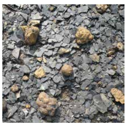
Stop 6. Pyrite nodules in shale.