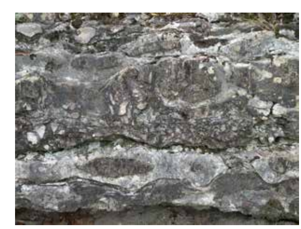
Stop 9. Cherty limestone in the Boone.